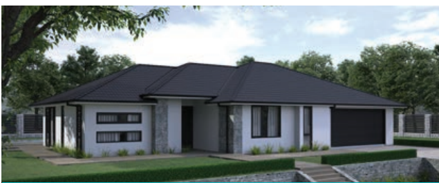
🏠 Style 2: Metal tile hip roof with plaster cladding