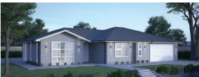
🏠 Style 3: Metal tile gable roof with Linea cladding

The Lifestyle range features 30 stylish home designs created by Milestone Homes to deliver comfortable, quality homes ideal for modern living. Functional and flexible, the cleverly designed Lifestyle range has a proven track record of happy homeowners from professional couples to large families.