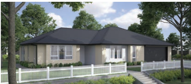
🏠 Style 1: Metal tile hip roof with brick and Linea cladding