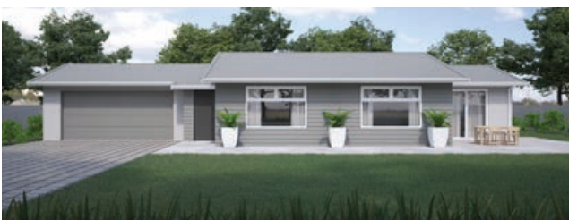
🏠 Style 3: Longrun gable roof with plaster and Linea cladding

The Lifestyle range features 30 stylish home designs created by Milestone Homes to deliver comfortable, quality homes ideal for modern living. Functional and flexible, the cleverly designed Lifestyle range has a proven track record of happy homeowners from professional couples to large families.