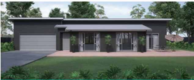
🏠 Style 2: Longrun mono roof with Linea cladding