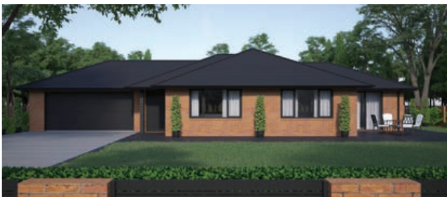
🏠 Style 1: Metal tile hip roof with brick cladding