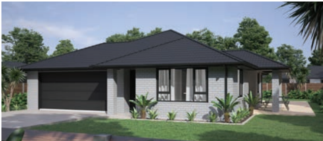
🏠 Style 1: Metal tile hip roof with brick cladding