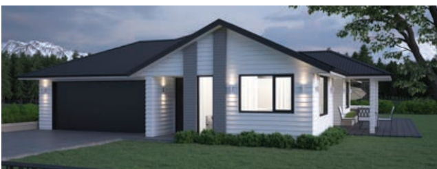
🏠 Style 3: Longrun gable roof with Linea cladding

The Lifestyle range features 30 stylish home designs created by Milestone Homes to deliver comfortable, quality homes ideal for modern living. Functional and flexible, the cleverly designed Lifestyle range has a proven track record of happy homeowners from professional couples to large families.