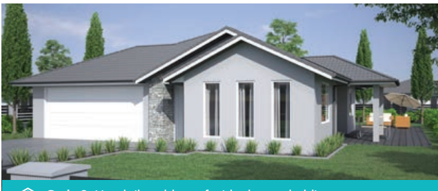
🏠 Style 2: Metal tile gable roof with plaster cladding