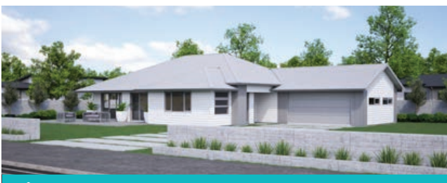
🏠 Style 3: Longrun gable roof with Linea cladding

The Lifestyle range features 30 stylish home designs created by Milestone Homes to deliver comfortable, quality homes ideal for modern living. Functional and flexible, the cleverly designed Lifestyle range has a proven track record of happy homeowners from professional couples to large families.