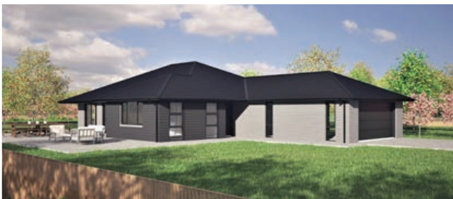
🏠 Style 1: Metal tile hip roof with brick and Linea cladding