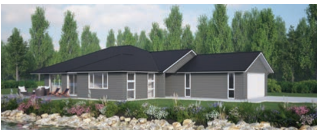
🏠 Style 2: Metal tile gable roof with Linea cladding