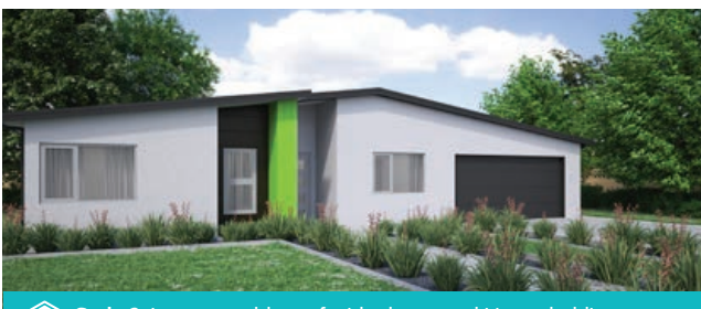
🏠 Style 2: Longrun gable roof with plaster and Linea cladding