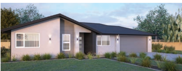
🏠 Style 3: Metal tile gable roof with plaster and Linea cladding

The Lifestyle range features 30 stylish home designs created by Milestone Homes to deliver comfortable, quality homes ideal for modern living. Functional and flexible, the cleverly designed Lifestyle range has a proven track record of happy homeowners from professional couples to large families.