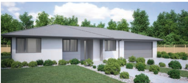
🏠 Style 1: Metal tile hip roof with plaster cladding