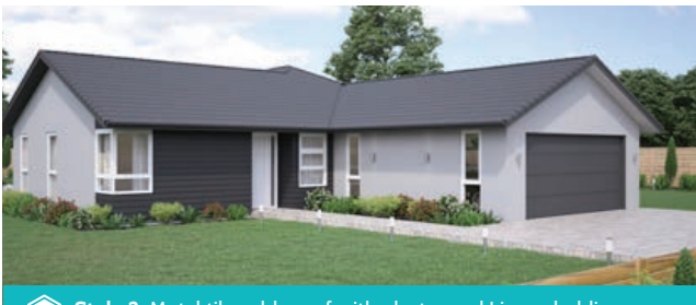
Style 2: Metal tile gable roof with plaster and Linea cladding