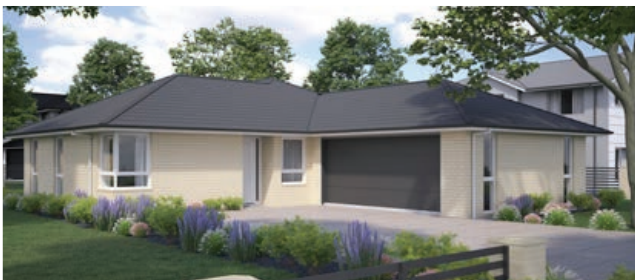
Style 1: Metal tile hip roof with brick cladding