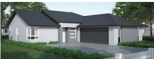
Style 3: Metal tile gable roof with plaster and Linea cladding

The Lifestyle range features 30 stylish home designs created by Milestone Homes to deliver comfortable, quality homes ideal for modern living. Functional and flexible, the cleverly designed Lifestyle range has a proven track record of happy homeowners from professional couples to large families.