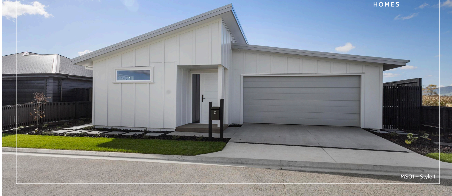
MS01 – Style 1