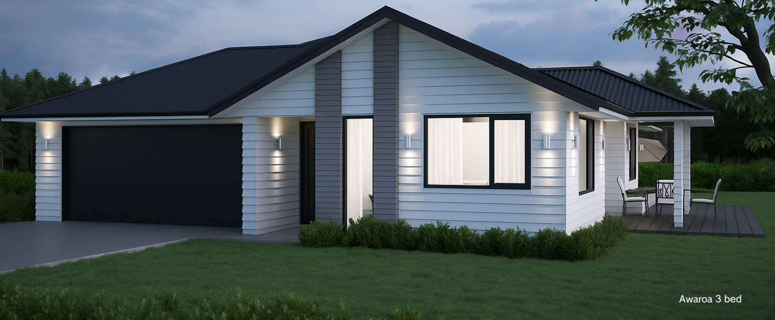
Awaroa 3 bed

31 Hoki Avenue, Lockerbie Estate, Morrinsville - POA