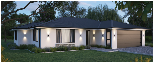
🏠 Style 2: Longrun hip roof with plaster cladding