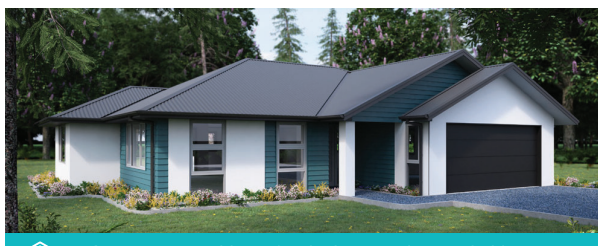
🏠 Style 3: Longrun gable roof with plaster and Linea cladding

The Lifestyle range features 30 stylish home designs created by Milestone Homes to deliver comfortable, quality homes ideal for modern living. Functional and flexible, the cleverly designed Lifestyle range has a proven track record of happy homeowners from professional couples to large families.