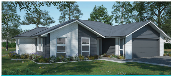
🏠 Style 1: Metal tile gable roof with brick and Linea cladding