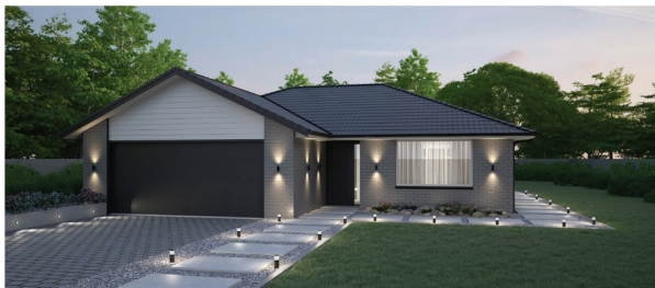
Style 1: Metal tile gable roof with brick and Linea cladding