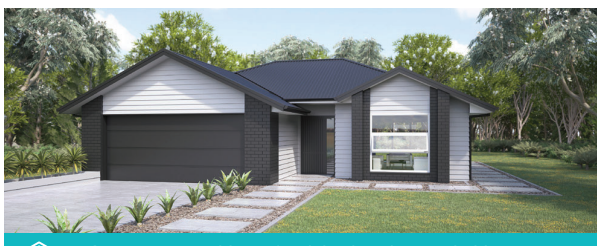
Style 3: Longrun gable roof with brick and Linea cladding

The Lifestyle range features 30 stylish home designs created by Milestone Homes to deliver comfortable, quality homes ideal for modern living. Functional and flexible, the cleverly designed Lifestyle range has a proven track record of happy homeowners from professional couples to large families.