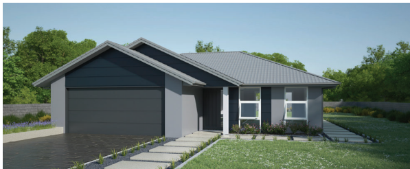
Style 2: Metal tile gable roof with plaster and Stria cladding