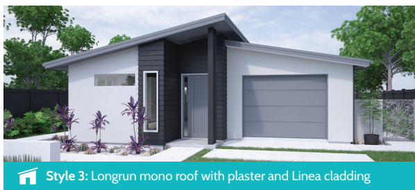
Style 3: Longrun mono roof with plaster and Linea cladding

The Lifestyle range features 30 stylish home designs created by Milestone Homes to deliver comfortable, quality homes ideal for modern living. Functional and flexible, the cleverly designed Lifestyle range has a proven track record of happy homeowners from professional couples to large families.