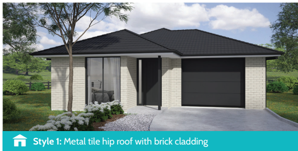
Style 1: Metal tile hip roof with brick cladding