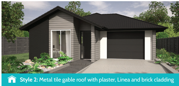
Style 2: Metal tile gable roof with plaster, Linea and brick cladding