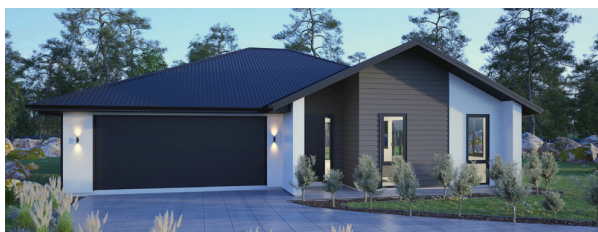
🏠 Style 3: Longrun gable roof with plaster and Linea cladding

The Lifestyle range features 30 stylish home designs created by Milestone Homes to deliver comfortable, quality homes ideal for modern living. Functional and flexible, the cleverly designed Lifestyle range has a proven track record of happy homeowners from professional couples to large families.