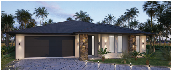
🏠 Style 2: Longrun hip roof with plaster cladding