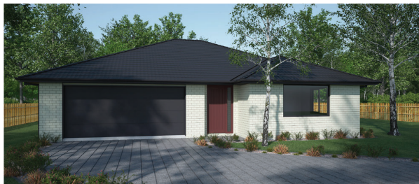
🏠 Style 1: Metal tile hip roof with brick cladding