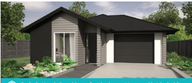
🏠 Style 2: Metal tile gable roof with plaster, Linea and brick cladding