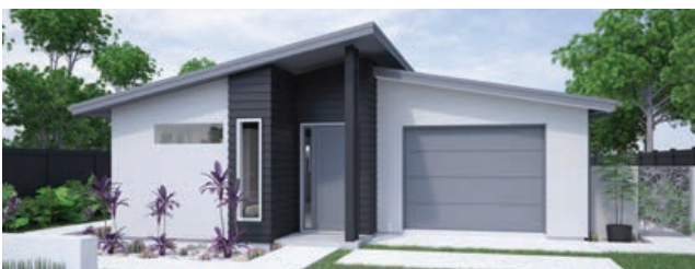
🏠 Style 3: Longrun mono roof with plaster and Linea cladding

The Lifestyle range features 30 stylish home designs created by Milestone Homes to deliver comfortable, quality homes ideal for modern living. Functional and flexible, the cleverly designed Lifestyle range has a proven track record of happy homeowners from professional couples to large families.