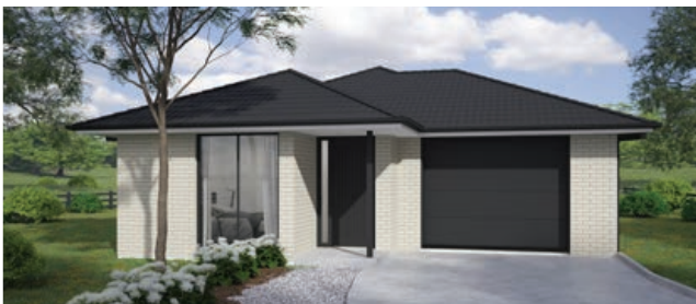
🏠 Style 1: Metal tile hip roof with brick cladding