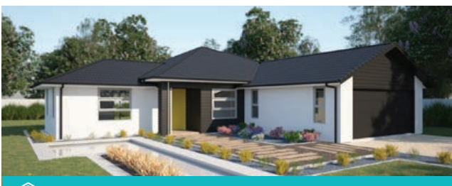
🏠 Style 3: Metal tile gable roof with plaster and Linea cladding

The Lifestyle range features 30 stylish home designs created by Milestone Homes to deliver comfortable, quality homes ideal for modern living. Functional and flexible, the cleverly designed Lifestyle range has a proven track record of happy homeowners from professional couples to large families.