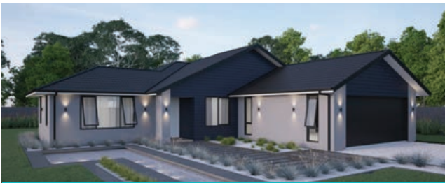
🏠 Style 2: Metal tile gable roof with plaster and Linea cladding