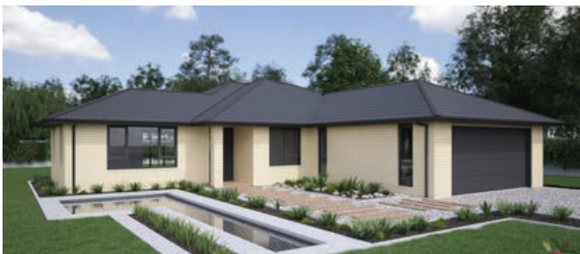
🏠 Style 1: Metal tile hip roof with brick cladding