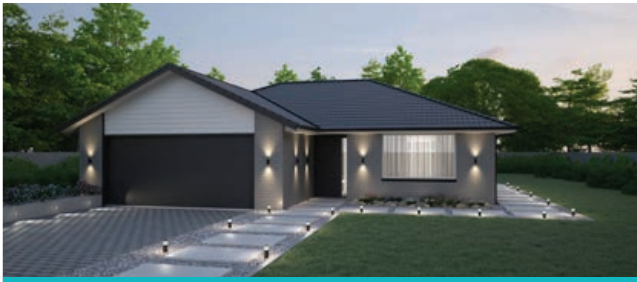
🏠 Style 1: Metal tile gable roof with brick and Linea cladding