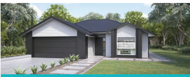
🏠 Style 3: Longrun gable roof with brick and Linea cladding

The Lifestyle range features 30 stylish home designs created by Milestone Homes to deliver comfortable, quality homes ideal for modern living. Functional and flexible, the cleverly designed Lifestyle range has a proven track record of happy homeowners from professional couples to large families.