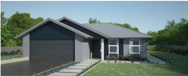
🏠 Style 2: Metal tile gable roof with plaster and Stria cladding