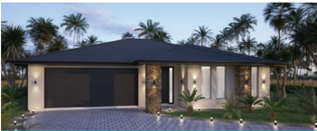
🏠 Style 2: Longrun hip roof with plaster cladding