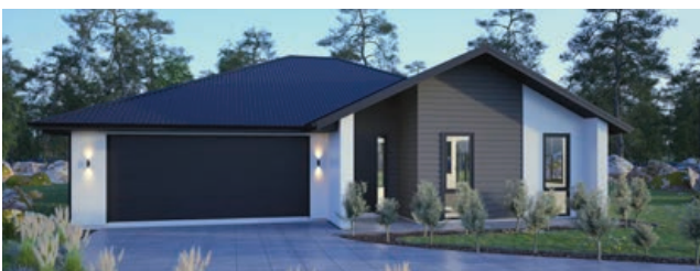
🏠 Style 3: Longrun gable roof with plaster and Linea cladding

The Lifestyle range features 30 stylish home designs created by Milestone Homes to deliver comfortable, quality homes ideal for modern living. Functional and flexible, the cleverly designed Lifestyle range has a proven track record of happy homeowners from professional couples to large families.