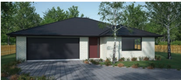
🏠 Style 1: Metal tile hip roof with brick cladding