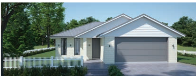
🏠 Style 3: Metal tile gable roof with brick and Linea cladding

The Lifestyle range features 30 stylish home designs created by Milestone Homes to deliver comfortable, quality homes ideal for modern living. Functional and flexible, the cleverly designed Lifestyle range has a proven track record of happy homeowners from professional couples to large families.