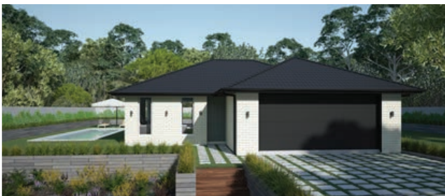
🏠 Style 1: Metal tile hip roof with brick cladding