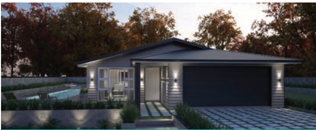
🏠 Style 2: Longrun gable roof with Linea cladding