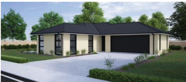
🏠 Style 1: Metal tile hip roof with brick cladding