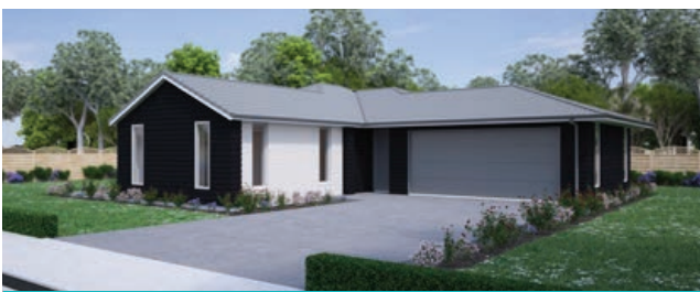
🏠 Style 2: Metal tile gable roof with Linea and brick cladding