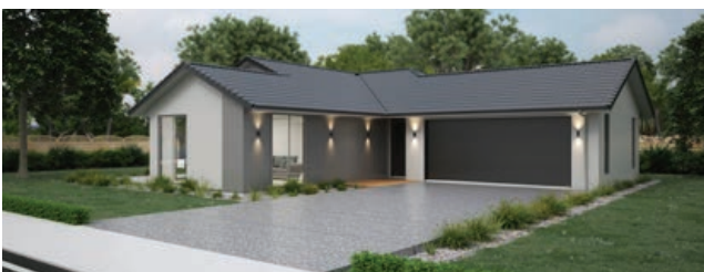
🏠 Style 3: Metal tile gable roof with plaster and Linea cladding

The Lifestyle range features 30 stylish home designs created by Milestone Homes to deliver comfortable, quality homes ideal for modern living. Functional and flexible, the cleverly designed Lifestyle range has a proven track record of happy homeowners from professional couples to large families.