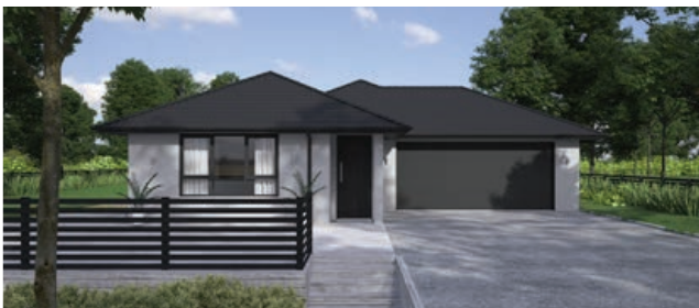
Style 1: Metal tile hip roof with plaster cladding