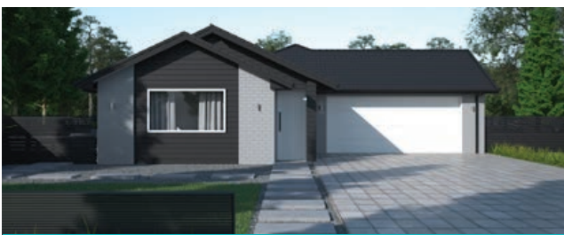
Style 2: Metal tile gable roof with brick and Linea cladding