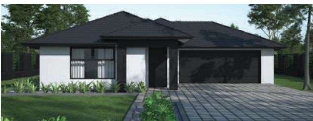
Style 3: Metal tile hip roof with plaster cladding

The Lifestyle range features 30 stylish home designs created by Milestone Homes to deliver comfortable, quality homes ideal for modern living. Functional and flexible, the cleverly designed Lifestyle range has a proven track record of happy homeowners from professional couples to large families.