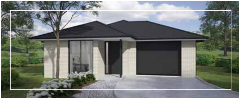
Style 1 Metal tile hip roof with brick cladding