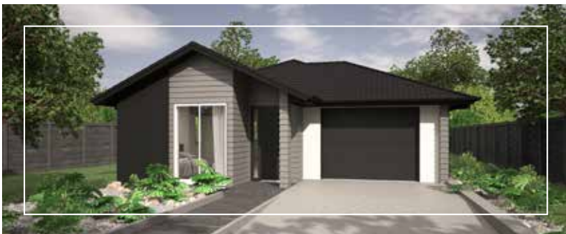
Style 2 Metal tile gable roof with plaster, linea and brick cladding