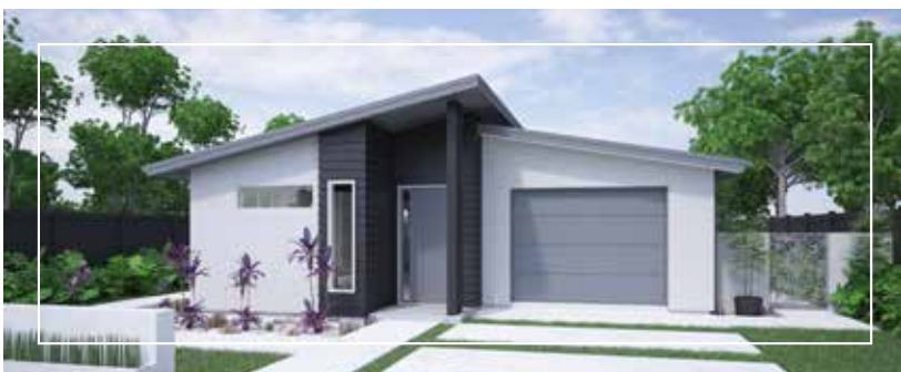
Style 3 Longrun mono roof with plaster and linea cladding