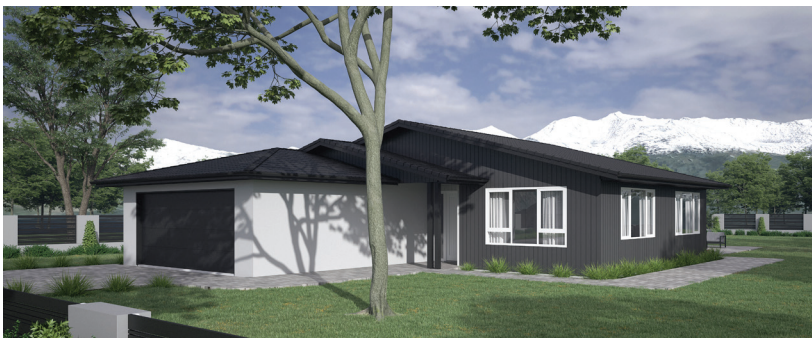
Style 3: Metal tile gable roof with plaster and linea cladding