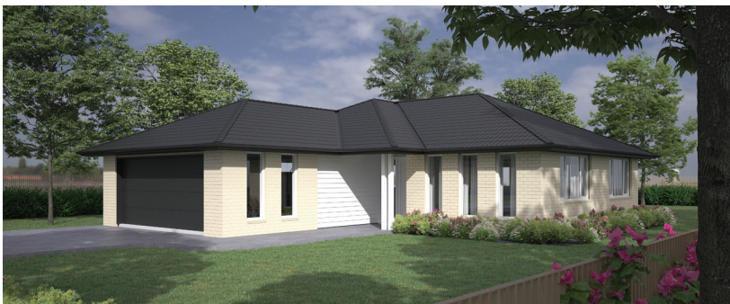
Style 2: Metal tile hip roof with brick and linea cladding