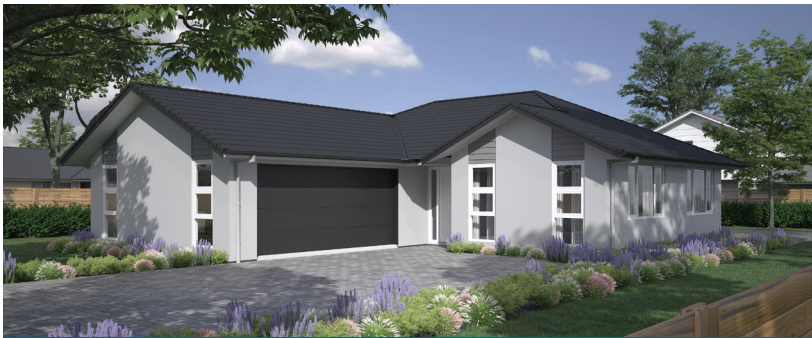
Style 1: Metal tile gable roof with plaster and linea cladding