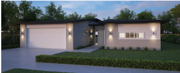
Style 2: Longrun mono roof with plaster and Linea cladding