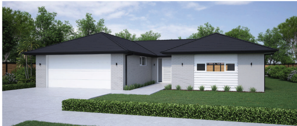
Style 1: Metal tile hip roof with brick and Linea cladding