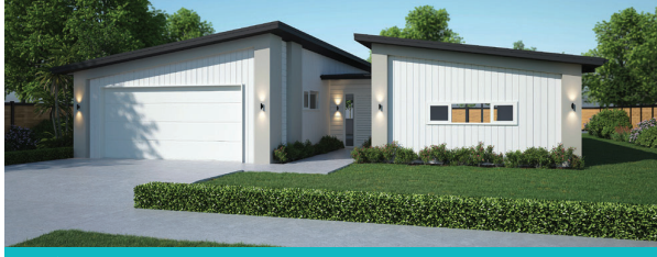
Style 3: Longrun mono roof with Linea and plaster cladding

The Lifestyle range features 30 stylish home designs created by Milestone Homes to deliver comfortable, quality homes ideal for modern living. Functional and flexible, the cleverly designed Lifestyle range has a proven track record of happy homeowners from professional couples to large families.