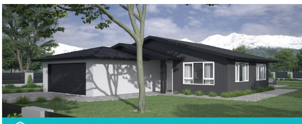
Style 3: Metal tile gable roof with plaster and Linea cladding

The Lifestyle range features 30 stylish home designs created by Milestone Homes to deliver comfortable, quality homes ideal for modern living. Functional and flexible, the cleverly designed Lifestyle range has a proven track record of happy homeowners from professional couples to large families.