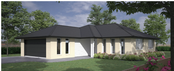
Style 2: Metal tile hip roof with brick and Linea cladding