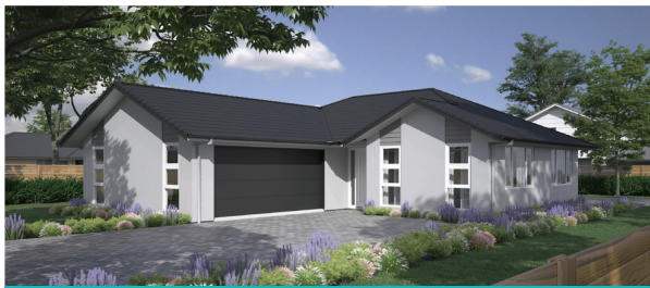
Style 1: Metal tile gable roof with plaster and Linea cladding