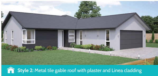
Style 2: Metal tile gable roof with plaster and Linea cladding