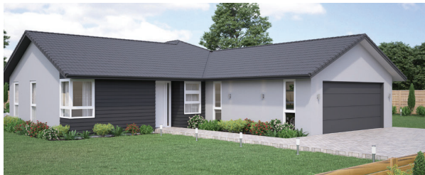
Style 2: Metal tile gable roof with plaster and Linea cladding