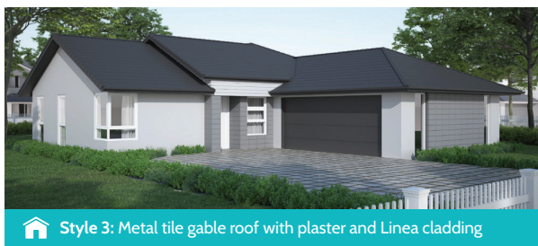
Style 3: Metal tile gable roof with plaster and Linea cladding

The Lifestyle range features 30 stylish home designs created by Milestone Homes to deliver comfortable, quality homes ideal for modern living. Functional and flexible, the cleverly designed Lifestyle range has a proven track record of happy homeowners from professional couples to large families.