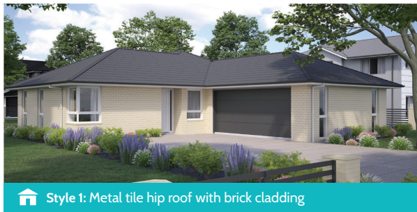
Style 1: Metal tile hip roof with brick cladding