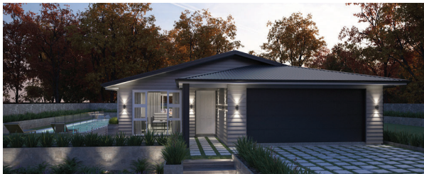
🏠 Style 2: Longrun gable roof with Linea cladding