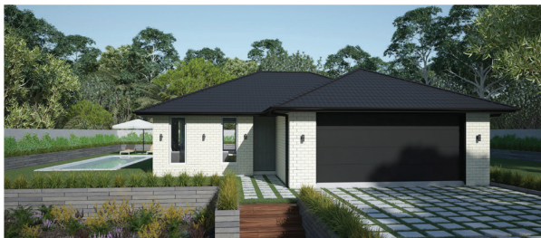
🏠 Style 1: Metal tile hip roof with brick cladding