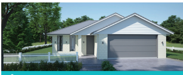
🏠 Style 3: Metal tile gable roof with brick and Linea cladding

The Lifestyle range features 30 stylish home designs created by Milestone Homes to deliver comfortable, quality homes ideal for modern living. Functional and flexible, the cleverly designed Lifestyle range has a proven track record of happy homeowners from professional couples to large families.