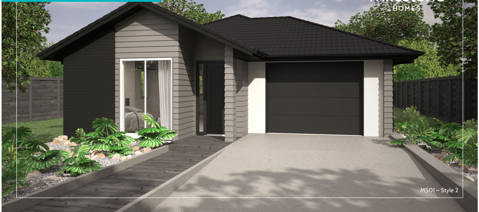
MS01 – Style 2