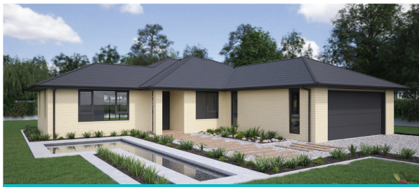
🏠 Style 1: Metal tile hip roof with brick cladding