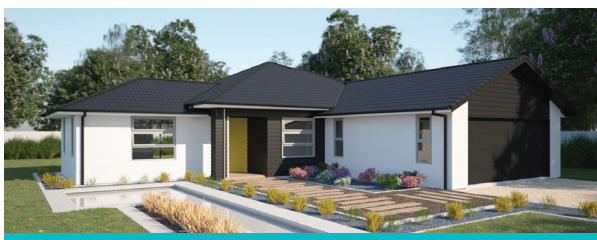
🏠 Style 3: Metal tile gable roof with plaster and Linea cladding

The Lifestyle range features 30 stylish home designs created by Milestone Homes to deliver comfortable, quality homes ideal for modern living. Functional and flexible, the cleverly designed Lifestyle range has a proven track record of happy homeowners from professional couples to large families.