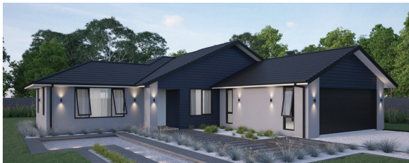
🏠 Style 2: Metal tile gable roof with plaster and Linea cladding