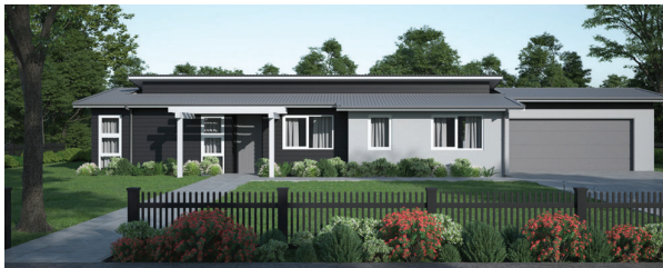
Style 2: Longrun mono roof with plaster and Linea cladding