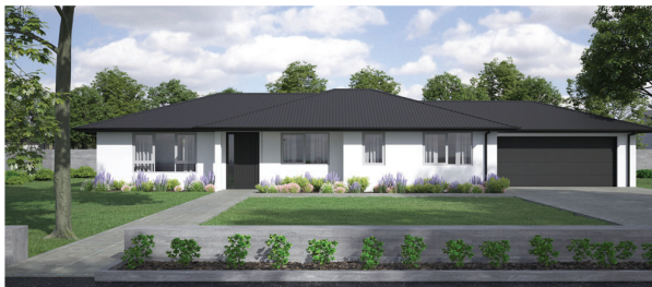
Style 1: Longrun hip roof with plaster cladding