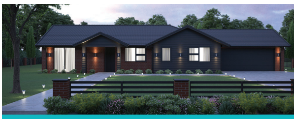
Style 3: Metal tile gable roof with brick and Linea cladding

The Lifestyle range features 30 stylish home designs created by Milestone Homes to deliver comfortable, quality homes ideal for modern living. Functional and flexible, the cleverly designed Lifestyle range has a proven track record of happy homeowners from professional couples to large families.