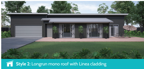
Style 2: Longrun mono roof with Linea cladding