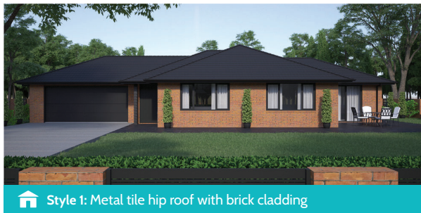
Style 1: Metal tile hip roof with brick cladding