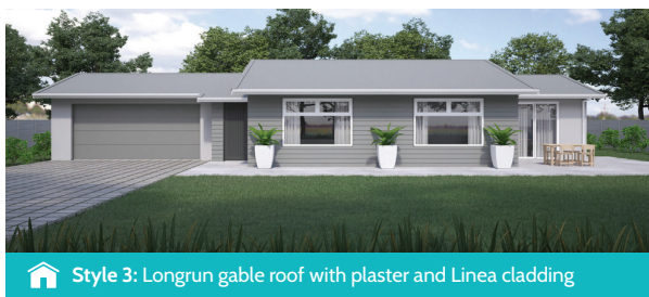
Style 3: Longrun gable roof with plaster and Linea cladding

The Lifestyle range features 30 stylish home designs created by Milestone Homes to deliver comfortable, quality homes ideal for modern living. Functional and flexible, the cleverly designed Lifestyle range has a proven track record of happy homeowners from professional couples to large families.