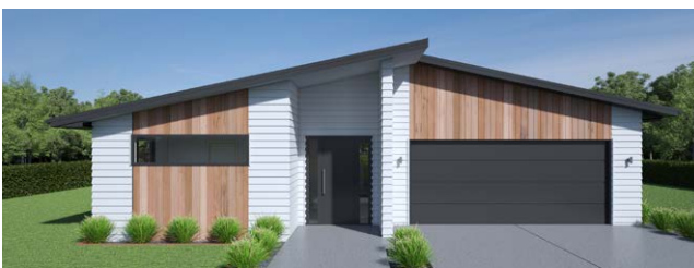
🏠 Style 3: Longrun mono roof with Linea and cedar cladding

The Lifestyle range features 30 stylish home designs created by Milestone Homes to deliver comfortable, quality homes ideal for modern living. Functional and flexible, the cleverly designed Lifestyle range has a proven track record of happy homeowners from professional couples to large families.