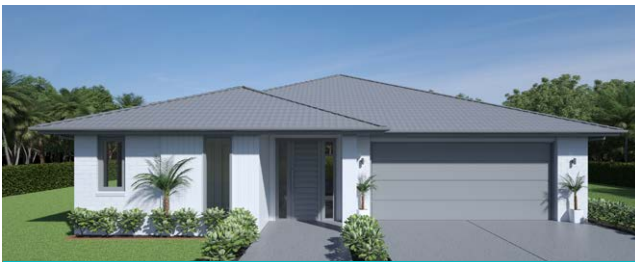
🏠 Style 2: Metal tile hip roof with Axon and brick cladding