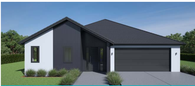
🏠 Style 1: Metal tile gable roof with Axon and plaster cladding